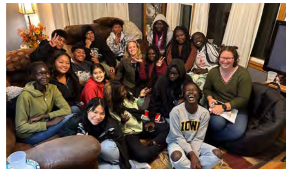
Fall Bible Study

Jesus doesn't sugar coat the fact that we will indeed have hurts, habits and hangups in our lives "troubles" that disrupt and break us. But he is quick to remind and encourage us about His purpose—He has overcome the world. His death and resurrection make us overcomers too. We have been introduced to so many overcomers these last months. Women living on little yet supporting their neighbor next door, youth inviting their friends to Tree House Support and Bible Studies, and a refugee and author who is impacting this world in mighty ways. Our eyes have been opened to these things this fall and we give thanks to God for the ways He is at work in Storm Lake and around the world overcoming obstacles that many times we don't even notice. Our fall Tree House and Service Days are off to a great start this fall. We had a wonderful night together at the banquet on October 21st and were all blessed by being together. Thank you for being in this with us. If you would like to support The Bridge, you can give at: www.thebridgeofstormlake.com . Just select the giving tab.