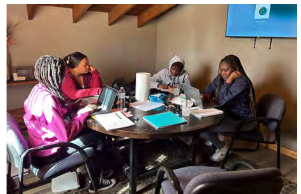
Youth studying in the Loft Cafe space.