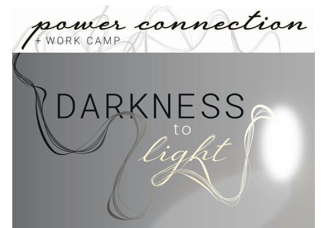
July 23 - 28, 2024 St Paul, Minnesota