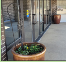
Pots out front

Do you have a knack for gardening and a love for the outdoors? We have two areas that need your help!