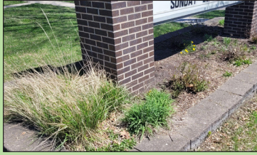
Flowerbed around marquee

By volunteering to maintain these spaces, you'll play a crucial role in keeping our church grounds beautiful and inviting. For more information and to get involved please contact the office at hrc@spencerhope.org or 712-262-3016.